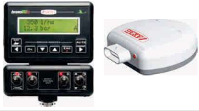
ARAG Bravo 180s 2 way with GPS Speed Antenna