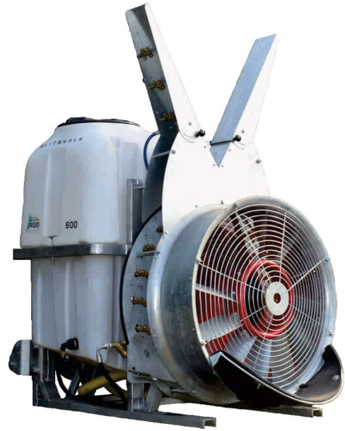
Fan Information (Tractor PTO @ 540rpm)